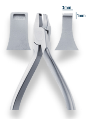
Horizontal Dimple Aligner Plier Item Code K60 732