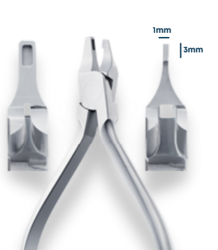
Vertical Dimple Aligner Plier Item Code