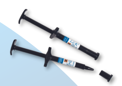
Item Code R LCR5 | 5g syringe