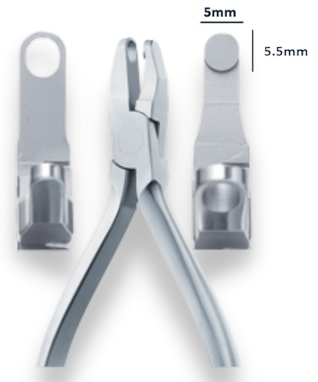
Hole Punch Aligner Plier Item Code K60 731