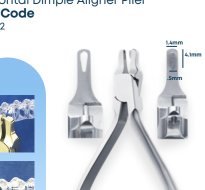
Tear Drop Hole Aligner Plier Item Code K60 734